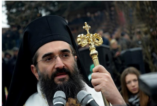
Figure 6. His Grace Arsenije, Bishop of Niš, blesses the participants of the Epiphany Cross swimming in Vlasotince.