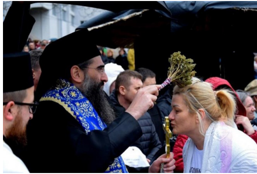
Figure 9. The only courageous woman among the men receives a blessing from His Grace, Bishop Arsenije of Niš.