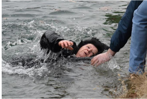
Figure 11. An elderly woman, while cheering on the brave young men, accidentally fell into the icy Vlasina River.

waters of the Vlasina River (Figure 11). It is important to highlight that, since the very beginning of this tradition in Vlasotince, nothing like this had ever occurred — until that moment, no bystander had ever fallen into the Vlasina River.