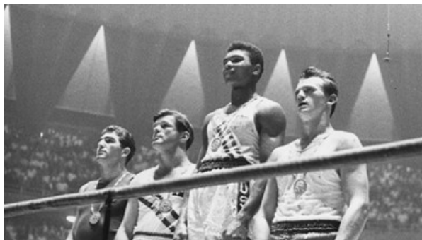
Picture 2. Olympic Games (Rome, 1960) Muhammad Ali receives his lost gold medal