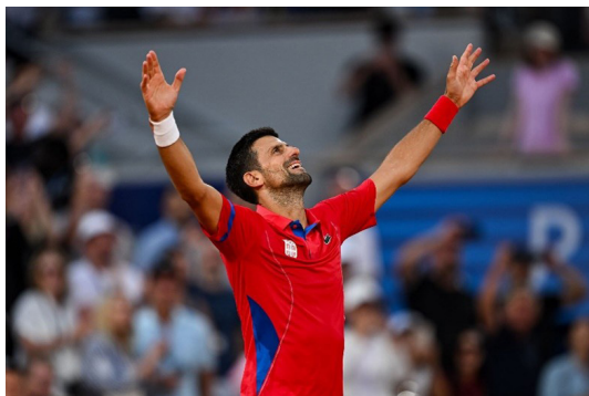
Picture 3. Novak Djokovic at the 2024 Paris Olympics.

Source: https://www.sportskeeda.com/tennis/news-watch-novak-djokovic-displaying-christian-faith-kissing-cross-necklace-paris-olympics-goes-viral-serb-reaches-maiden-final-event ,