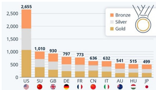
Table 2. Countries with the most medals won at the Summer Olympics since 1896.