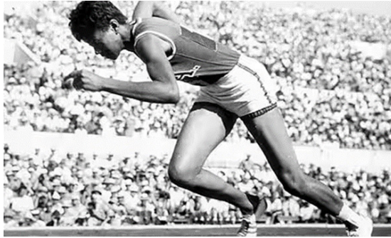
Picture 1. Wilma Rudolph makes history in 1960.

Source: https://www.theguardian.com/sport/blog/2012/jun/01/50-stunning-olympic-moments-wilma-rudolph