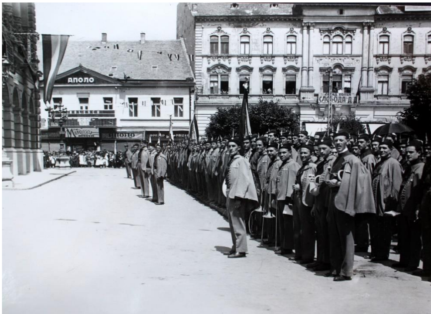
Novi Sad Sokols, welcoming King Alexander, Novi Sad, 10 June 1934.

conditions for greater influence on the cultural, educational, pedagogical and health transformation of the population in the towns and villages. Thus, the Sokol of the Kingdom of Yugoslavia reached its zenith in the 1930s and is the leading Sokol organisation alongside the Czechoslovak one.