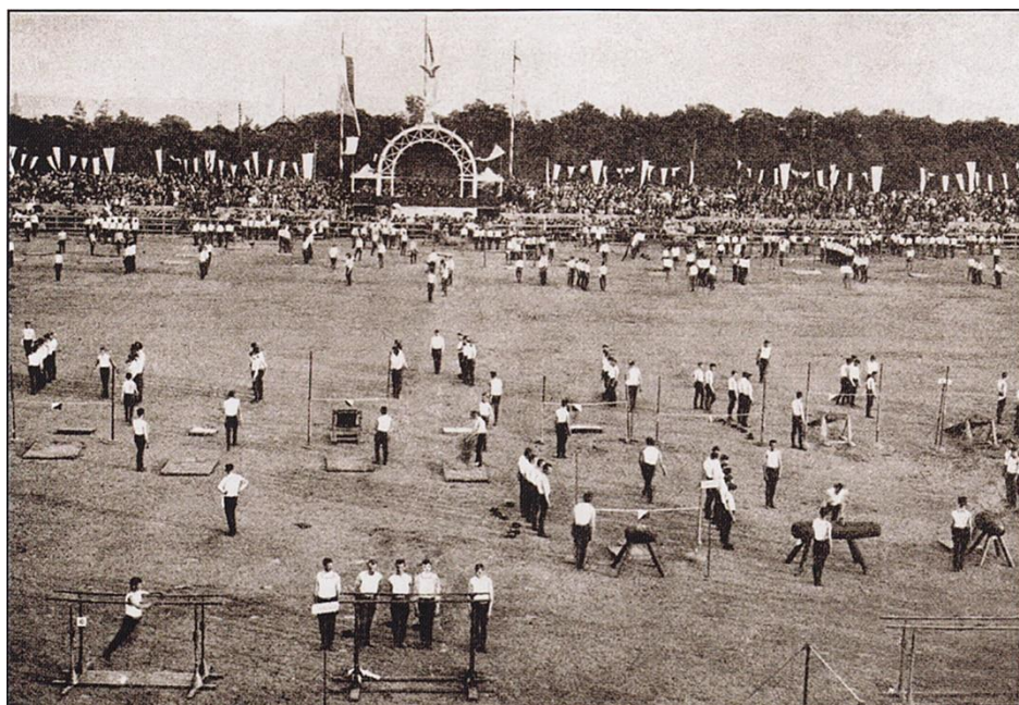
The third All-Sokol Congress, Prague, 1895.

consciousness, and the moral and physical revitalisation of the people, spread quickly and was promoted through physical exercise and mass performances by the Sokol members. The Sokols were taught in the spirit of the principles of the original Sokol movement which were based on libertarian ideas and the principles of civil society emerging from the French democratic revolution (credo: "liberty, equality, fraternity"), and the philosophy of the ancient Hellenes (the ideals of harmony of physical and spiritual development of man). The aim was to strengthen the mass movement, whose members came together regardless of class, nationality and religion, by spreading the ideas of democracy, altruism, equality, and brotherhood. In our country, the Sokol movement is recognised both as an exercise system and as an ideological movement of the Slavs to physically strengthen and promote an enlightened, cultured, nationally conscious, moral and healthy individual.