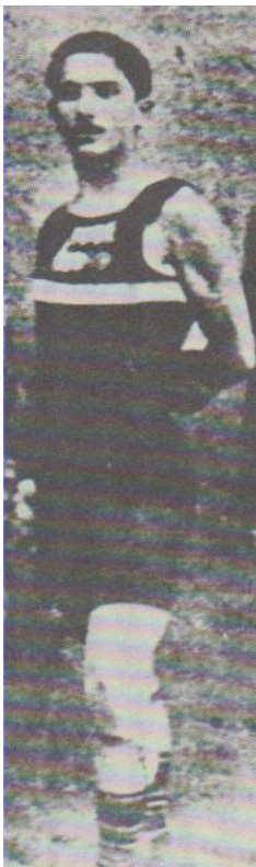
Olympian Dragutin Tomasevic, 1912.

The Sokol movement in the newly created Kingdom of Serbs, Croats and Slovenes (proclaimed in Belgrade on December 1, 1918) - "tribal" organizations (national Sokol organizations) united in a single Sokol organization. At the first Sokol Assembly (Vidovdan, June 28, 1919, in Novi Sad), Duke Živojin Mišić, the Commander-in-Chief of the Army, addressed the people with the words: "The Sokols will be a granite wall for the enemies" The unified " Sokol Association of the Kingdom of Serbs, Croats and Slovenes " was proclaimed, as well as the basic principle and ideological credo: "One country, one nation, one Sokol movement" . In 1920, the Association was then renamed the Yugoslav Sokol Association (Vukašinović, 2014).