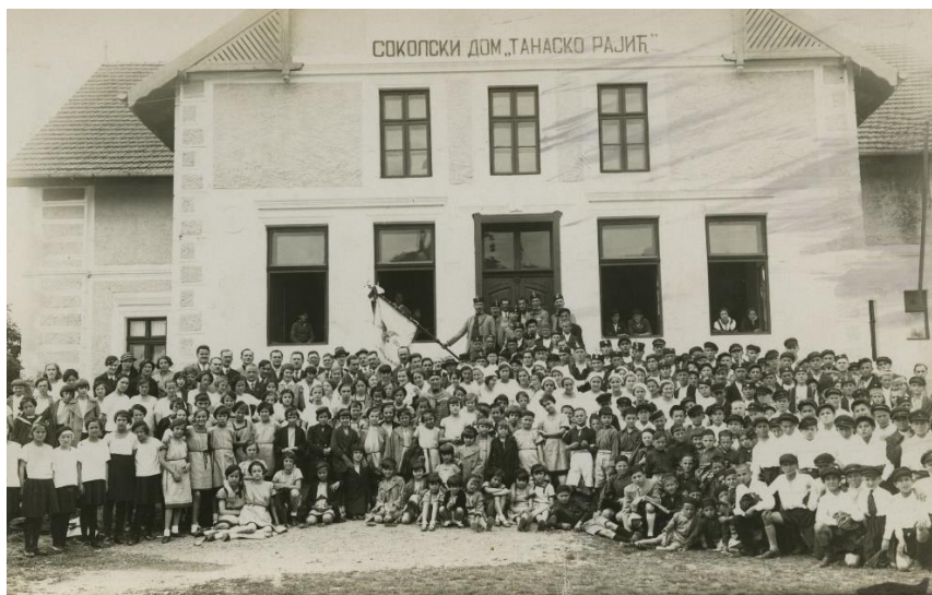
"Sokols of Čačak" - postcard, 1926.

However, the regular activity of the Yugoslav Sokol movement was hindered in the first years by political conflicts that had already arisen in the young country (due to the secession of a part of the Croatian Sokol movement in 1922). There was also a threat of dissolution of the Association, but the leaders of the Sokol movement did not allow this and resorted to the idea of holding joint landings.