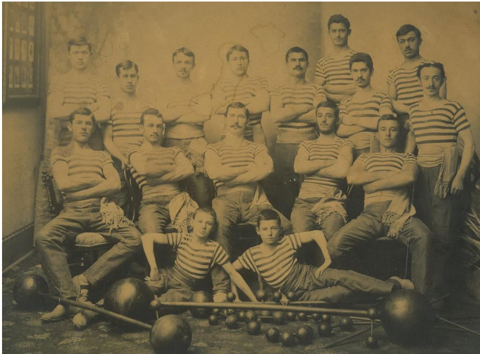
Belgrade Gymnastics and Combat Society, 1889.