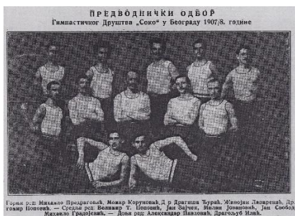
Gymnastics Society "Sokol" Belgrade, 1907/8.