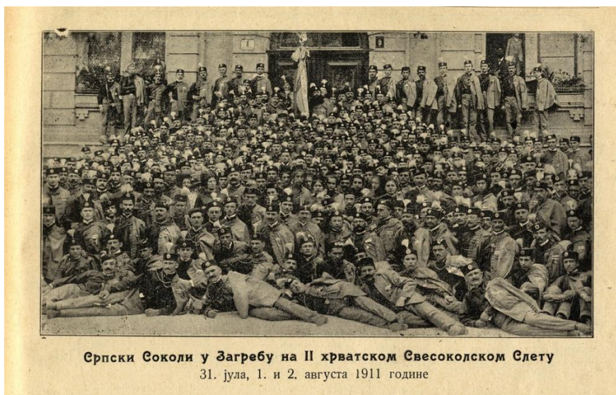
Serbian Sokols at the Second All-Sokol Croatian Slet, Zagreb, 1911.