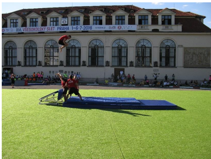
Sokols of "Belgrade Matica" jumping from the trampoline in front of Tyrš's House, Prague, 2018.