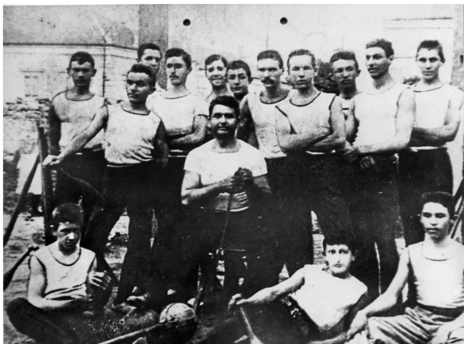
Ball department Sokol , is the oldest photo of the first football team in the Kingdom of Serbia, 1898.