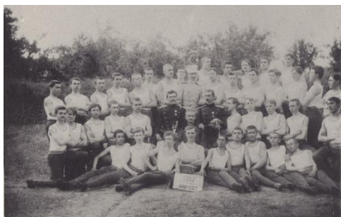
"Niš Sokol, a memorial to the citizens of Belgrade, 1907."