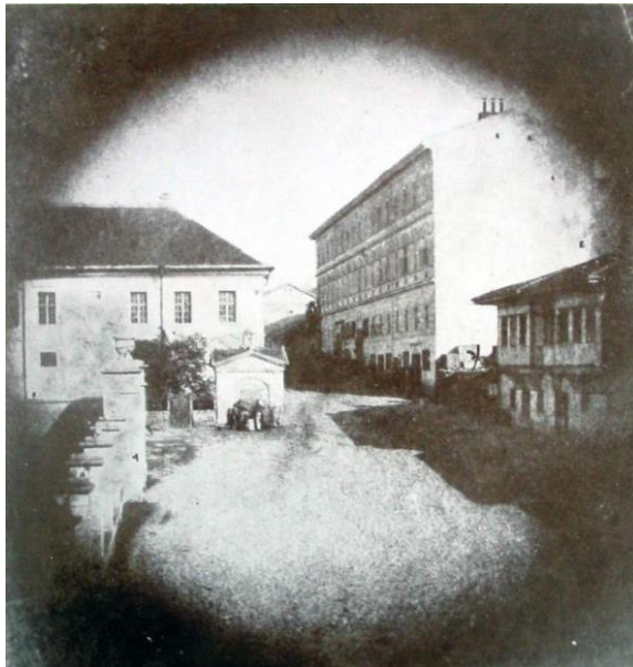
Up to 80 members of the Gymnastics and Combat Group trained in the Old Building