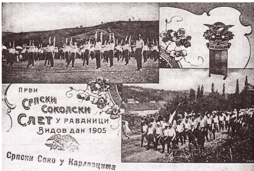
The first Serbian Sokol Slet, Ravanica, 1905.