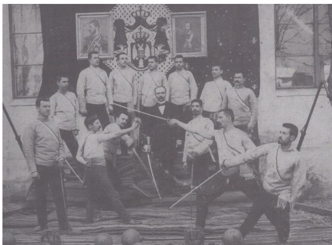
Fencing school of Gymnastics Society "Dušan Silni", 1892.