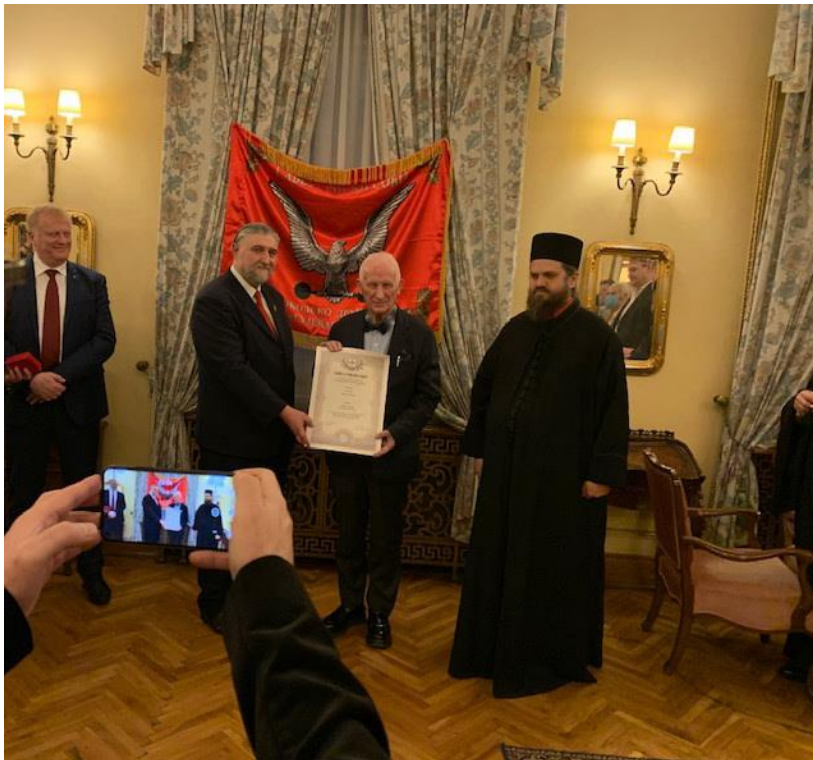
At the reception of the Serbian Sokol Association on the occasion of the restoration of the Serbian Sokol movement, Belgrade, 2022.