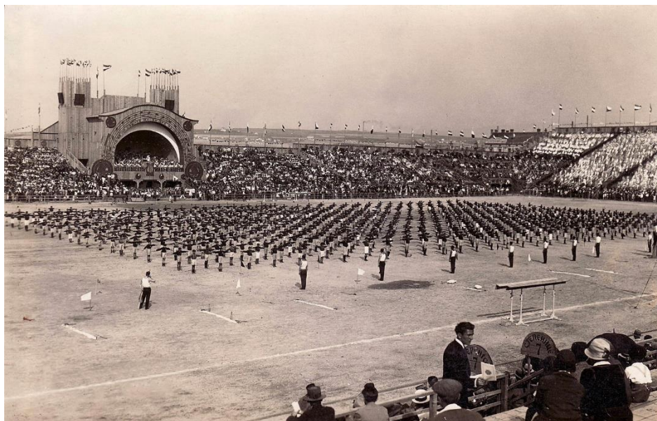
The first All Sokol Slet of the Kingdom of Yugoslavia, Belgrade, 1930.