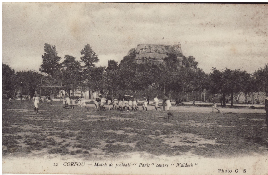
The rugby game of French soldiers in Corfu 1916

The popularity of rugby has led the sport to be included in the programs of the 1900 Olympic Games in Paris and eight years later in London.