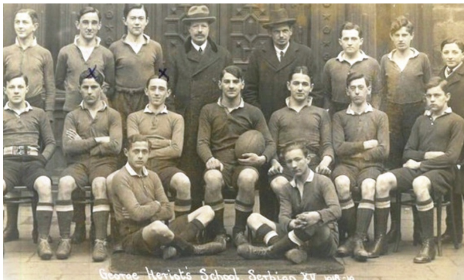
The Serbians rugby team of Serbian boys attend George Heriot School in Edinburgh